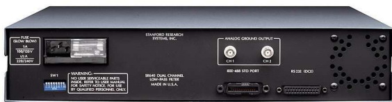
SR640 rear panel